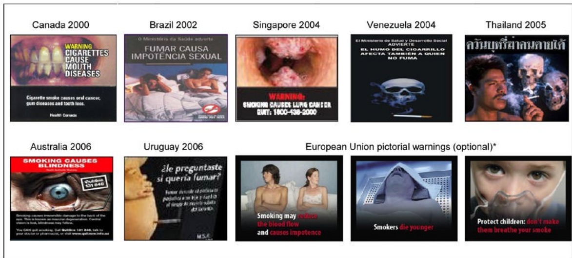
Figure 4. Countries with picture-based health warnings

*A set of pictorial warnings has been created for European Union members; however, each member can decide whether or not to adopt the pictorial warnings in place of the mandatory text-based warnings.